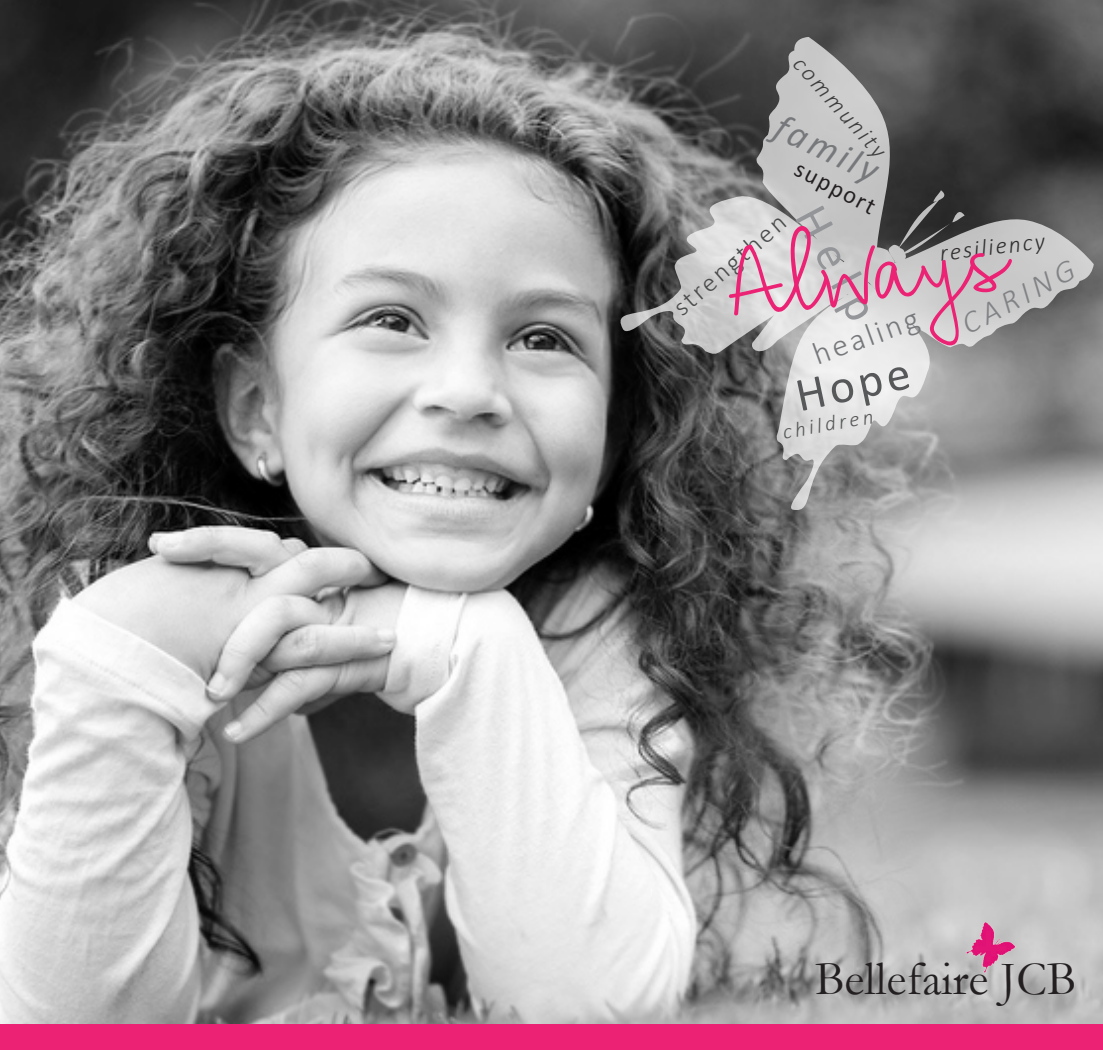
Annual Report 2015-16